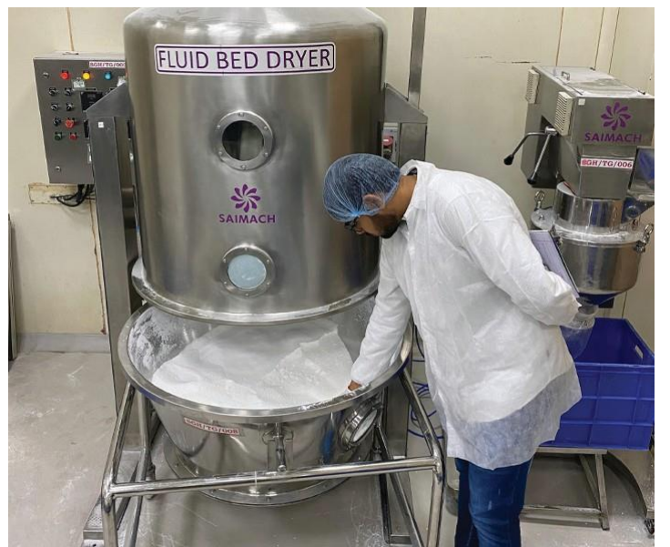
PHARMACEUTICAL MANUFACTURING TRAINING