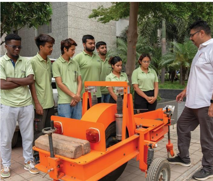
DESIGN & MAINTENANCE SKILLS FOR PAVEMENTS