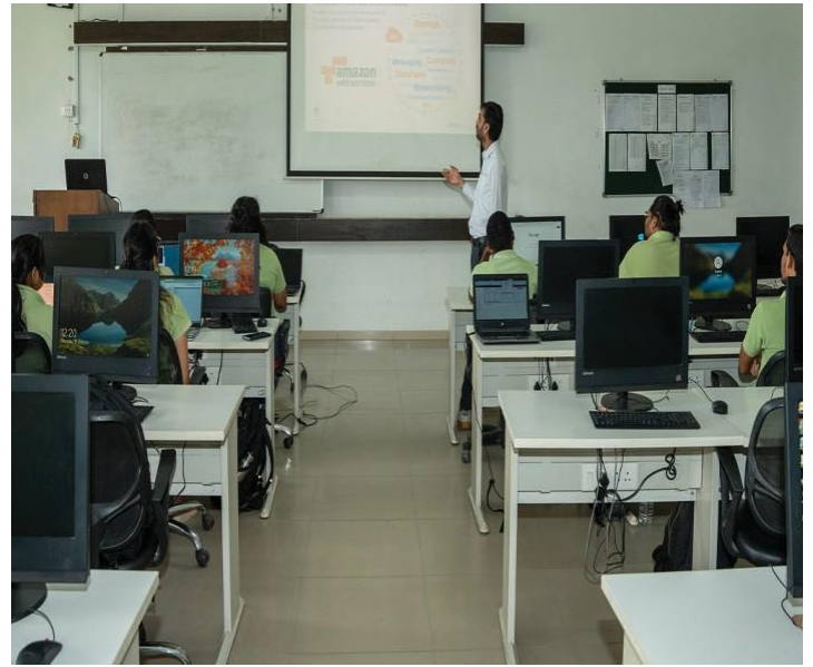
AWS ACADEMY DATA ENGINEERING