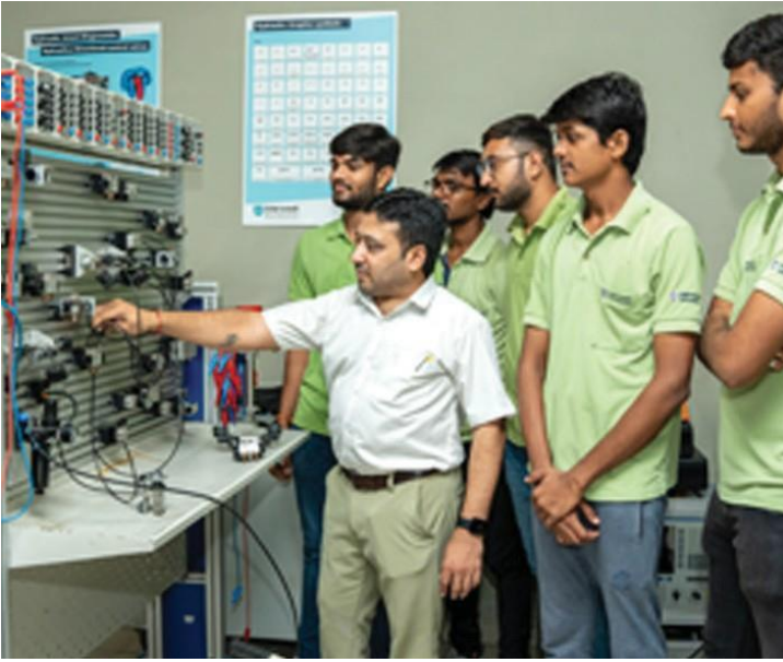
BASIC & ELECTRO HYDRAULICS