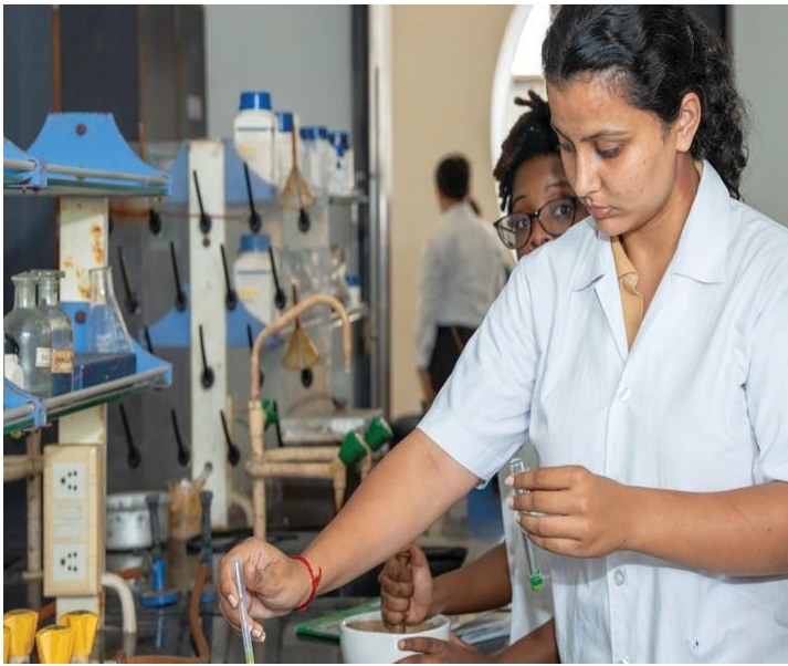
WATER QUALITY TESTING