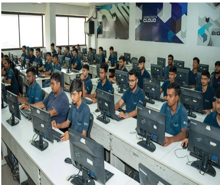
WEB DESIGN USING UI/UX