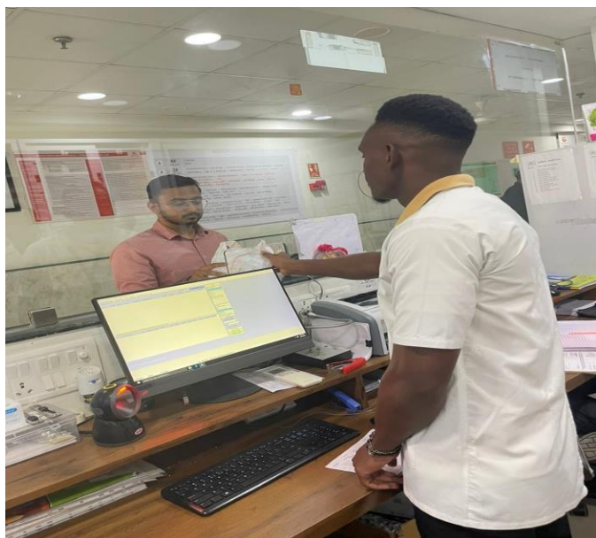
PHARMA INDUSTRIAL TRAINING