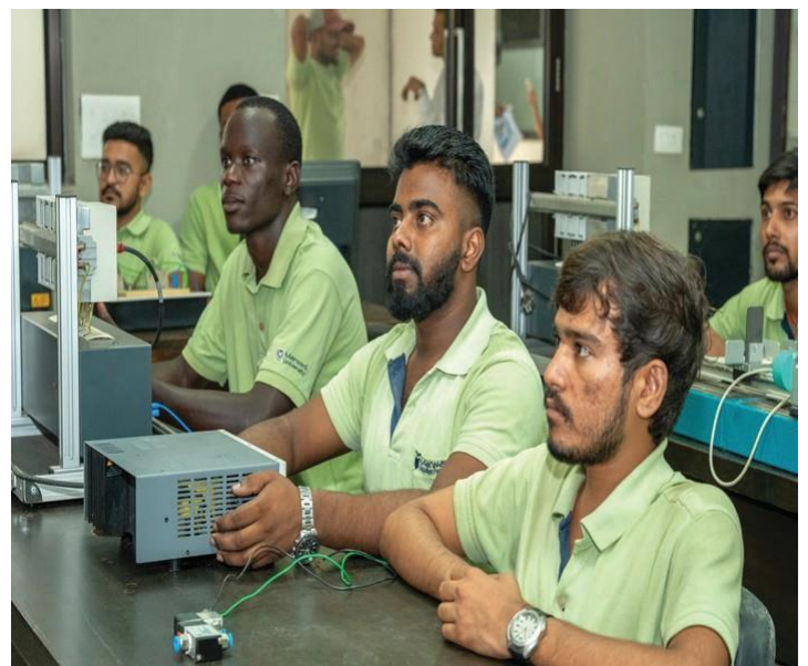
PLC PROGRAMMING FOR AUTOMATION