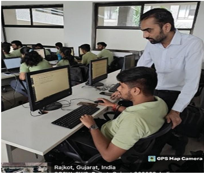
ORACLE: DATABASE PROGRAMMING WITH SQL