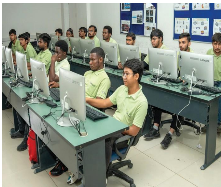
DESIGN THINKING AND PROBLEM SOLVING