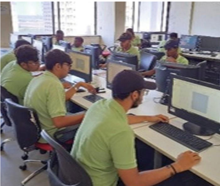
CAD (MECHANICAL ENGINEERING)