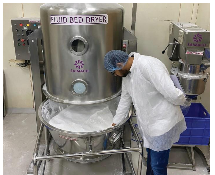
PHARMACEUTICAL MANUFACTURING TRAINING