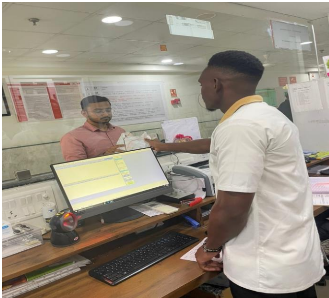
PHARMA INDUSTRIAL TRAINING