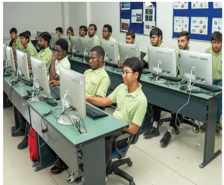
DESIGN THINKING AND PROBLEM SOLVING